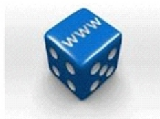
DOMAIN & HOSTING