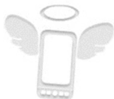
SHORTCODE & SMS